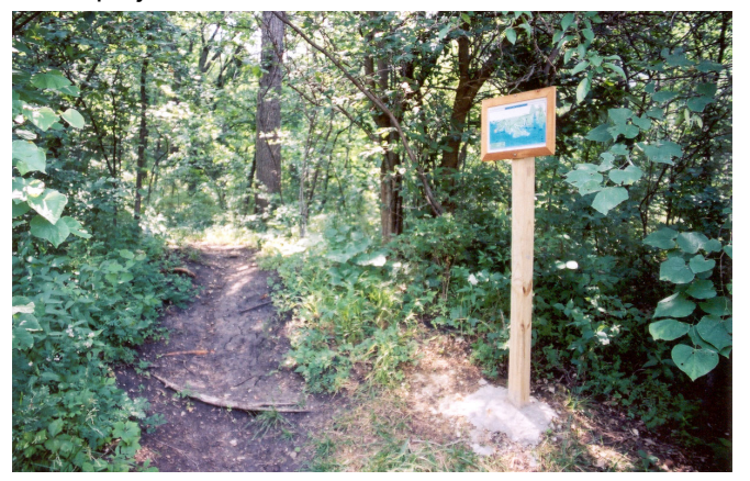
Friends of the Trail contributions are tax deductible and directly benefit the selected trail.

In 2003, the KTC initiated a new program enabling members to contribute directly to their trail of choice. One of the projects funded by these contributions was the installation of trail map displays on the Clinton North Shore Trails (see photo). The trail map display materials were purchased using contributions from the Friends of the Trail program, then area Boy Scouts assembled and installed the six displays as an Eagle Scout project last summer.