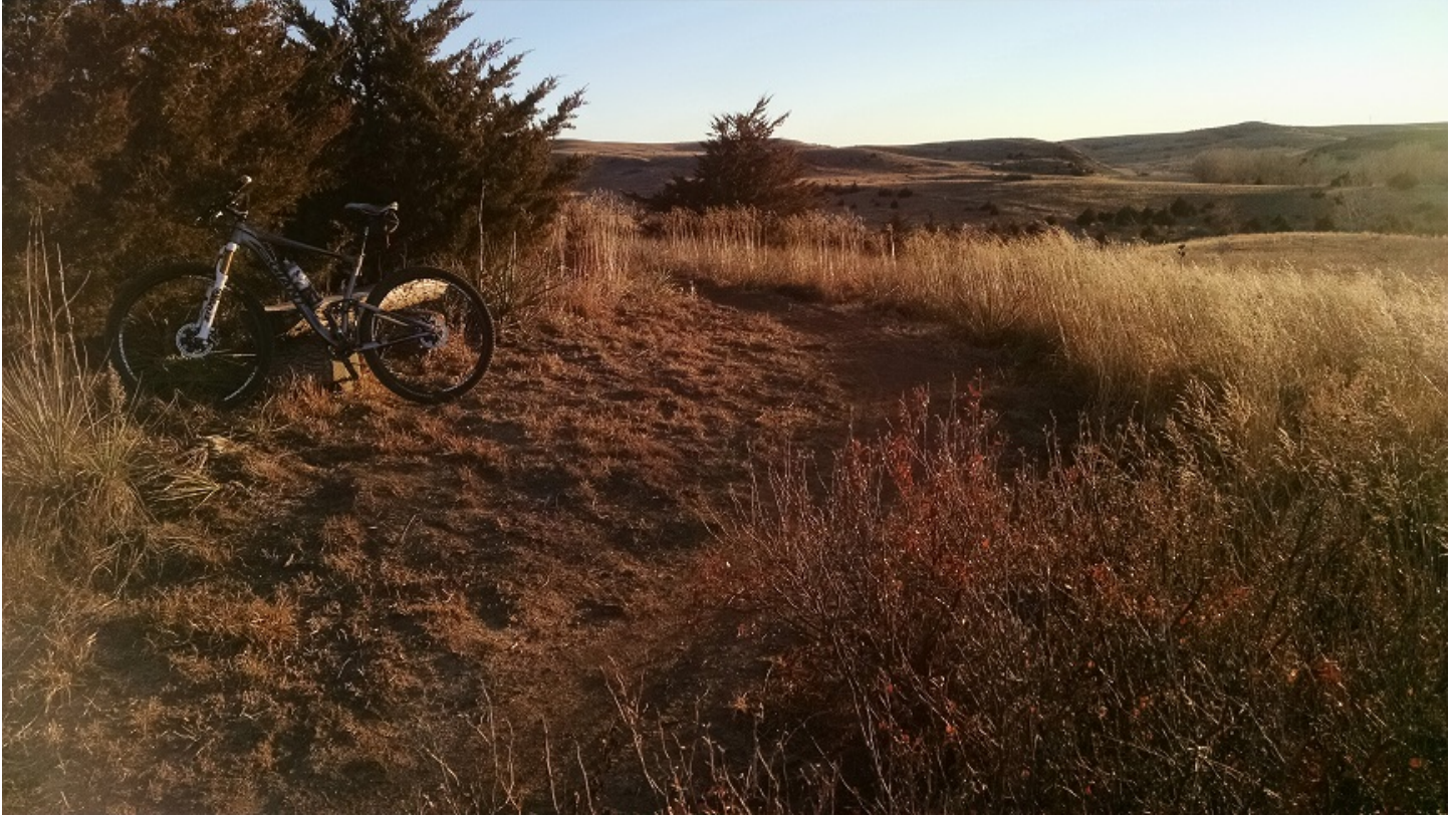
Wilson Lake – Switchgrass Trail