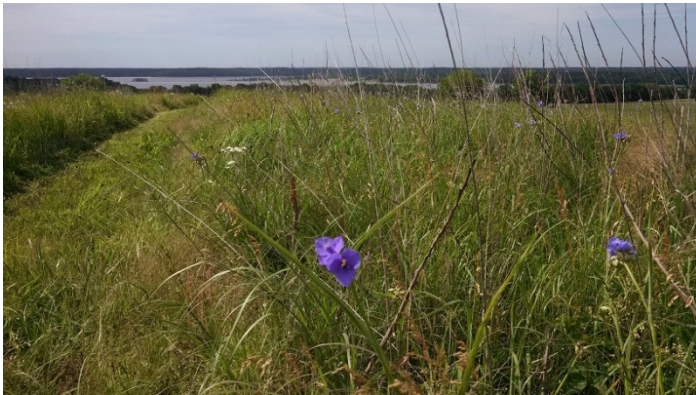
Wildflowers On Bunker Hill (Clinton State Park)

Besides an occasional tree dropped by thunderstorms, the trails are open and clear. Ticks are more abundant than in any recent year. Repellant is helpful, but not foolproof so please check for the little hitchhikers when returning from a ride, hike or run. The wild flowers are also more abundant this year. The view from Bunker Hill on the north sided of Clinton State Park reveals the lake panorama as well as a variety of wildflowers.