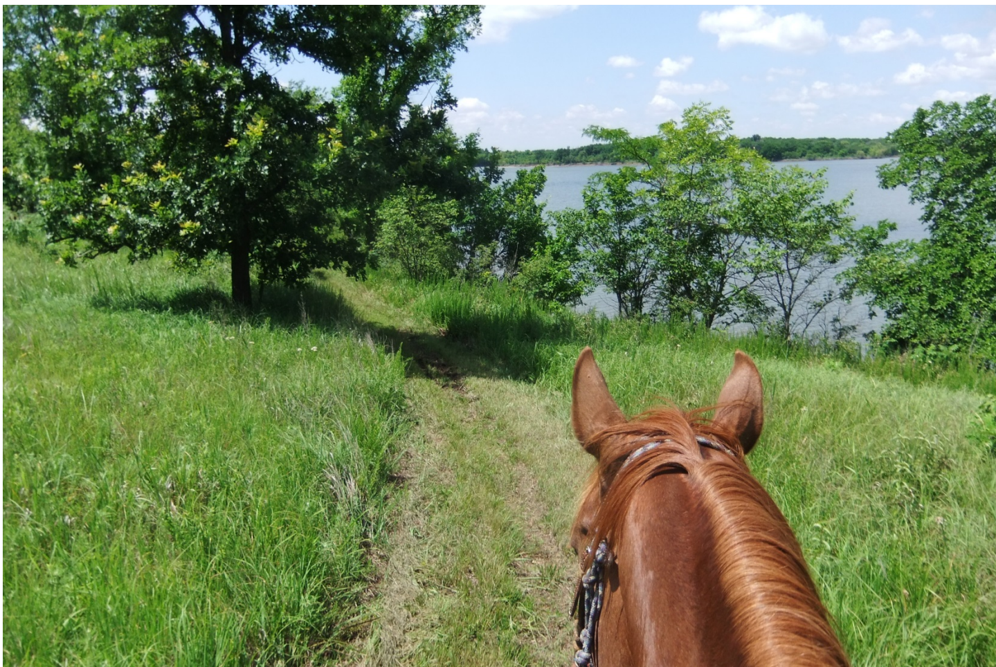
Crooked Knee Equestrian Trail – Eisenhower State Park