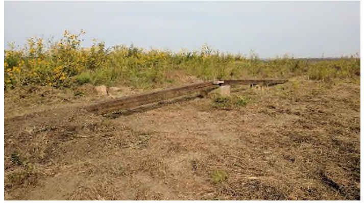
A new "skinny" at Skyline... wear your helmet!