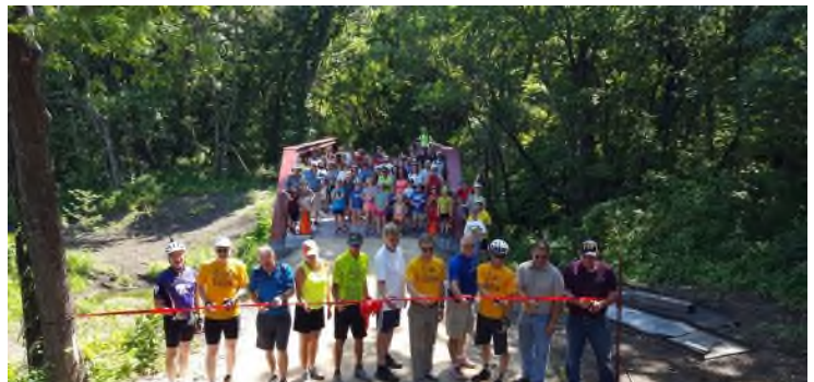
Celebrating the opening of the Lehigh Portland Trail network in 2016. The trails play a prominent role in the RWJ video.

As a reminder, the KTC Trail in a Box got put to significant use in Allen County over the past few years to help build an extensive singletrack trail system as part of the Lehigh Portland Trails. These trails are the result of an innovative public-private partnership that took undeveloped industry land and leased it to the city for public recreation. The chair of Iola Industries spoke at the Sept. 19 event and said, "This concept [trails and recreation area] helped us take a liability and transform it into a true community asset. This area is now something that makes people want to move here."