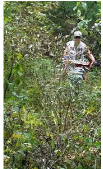
Can you find the dedicated trail volunteer in the thick brush???

Due to the large amount of rain we received this summer and some high winds, the South Shore Trails were desperately in need of major clearing. Dozens of large trees were across the trails; undergrowth and weeds were rampant. Due to a freak chainsaw accident in August, which left me with a dislocated shoulder, I am unable to work the trails for the rest of this year. Thankfully, members from the Topeka Brushbusters and Back Country Horseman of Kansas flocked to my aid and spent over 200 hours in September getting the trails into safe riding condition. I can't thank these 14 volunteers from Lake Perry, Hillsdale, and Melvern enough for taking the time to come to our trails and helping out. For the first time we used the walk behind DR from the Kansas Trails Council to clear a 2 mile section of overgrown trail. What a great machine! We look forward to using it again to improve our trails. We will be having another work weekend this fall to improve several very rocky sections of the trail around the campground. Back Country Horseman of Kansas will be bringing in a mini excavator to help with this task. Looking forward to seeing how well this will work! We all hope using these two new machines will vastly improve the footing on our trails.