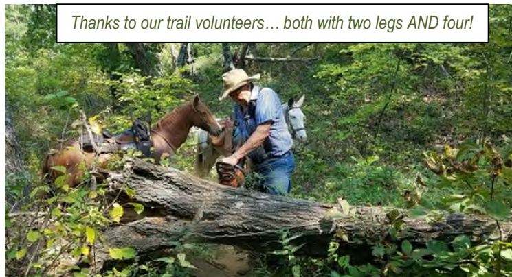
Thanks to our trail volunteers... both with two legs AND four!

There have been several special events at Clinton this summer and quite a few large riding groups from inside and outside of Kansas that visited our park and rode the trails. The fall trail riding season is now upon us... I just hope that more people that use our trails will step up and take a hand in maintaining them!