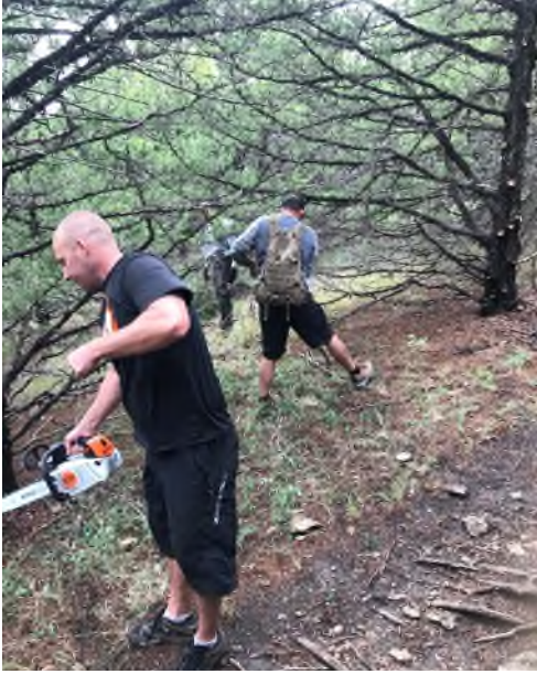
MHK volunteers create and maintain some awesome trails with help of TIAB mainly tools and equipment.