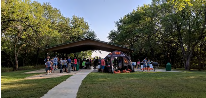
Runners and crew teams gather for the 7 th Annual Hawk 100

This summer has seen higher than normal traffic on the trails with the Corps parking lot completely full on some weekends. The Lawrence Trail Hawks have been indispensable trail volunteers reporting on fallen trees and trail conditions and trimming and lopping substantial trail sections to keep everything in prime condition.