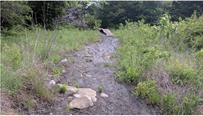
This boardwalk will be getting a facelift soon.